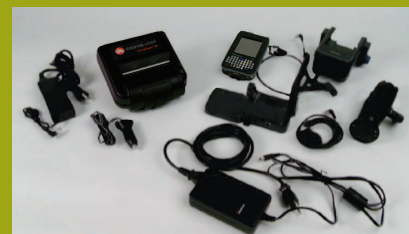
Accessories used in a typical application involving a separate printer and mobile computer.