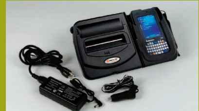
Accessories used to charge both the PrintPAD and mobile computer

No hidden cost - Another way to keep cost down is to look for hidden cost. Unlike some other products on the market, the PrintPAD batteries are included in the purchase price. And when its time to replace them, the PrintPAD uses economical replacement batteries. This can add up to big savings for your company.